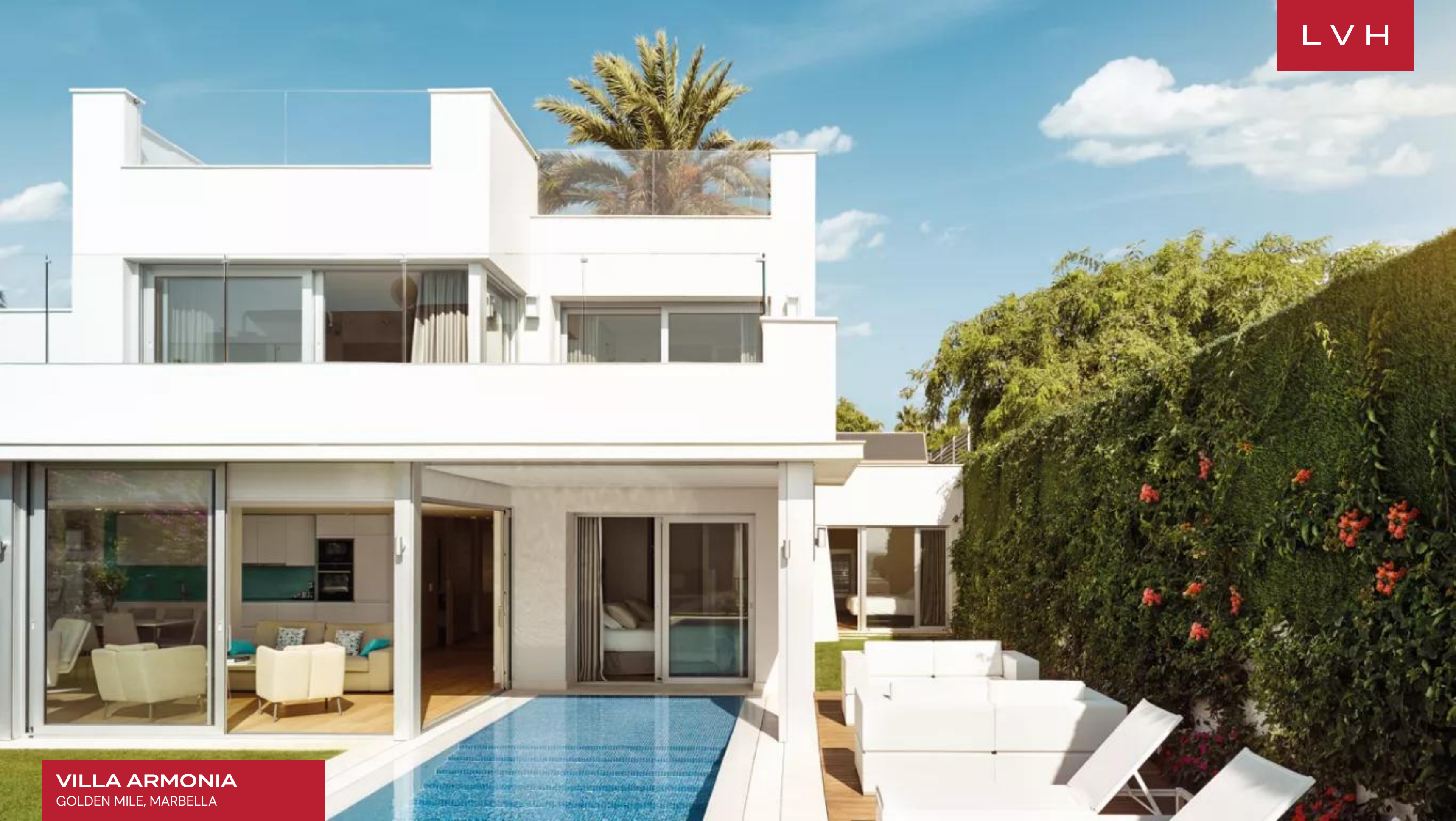
VILLA ARMONIA GOLDEN MILE, MARBELLA