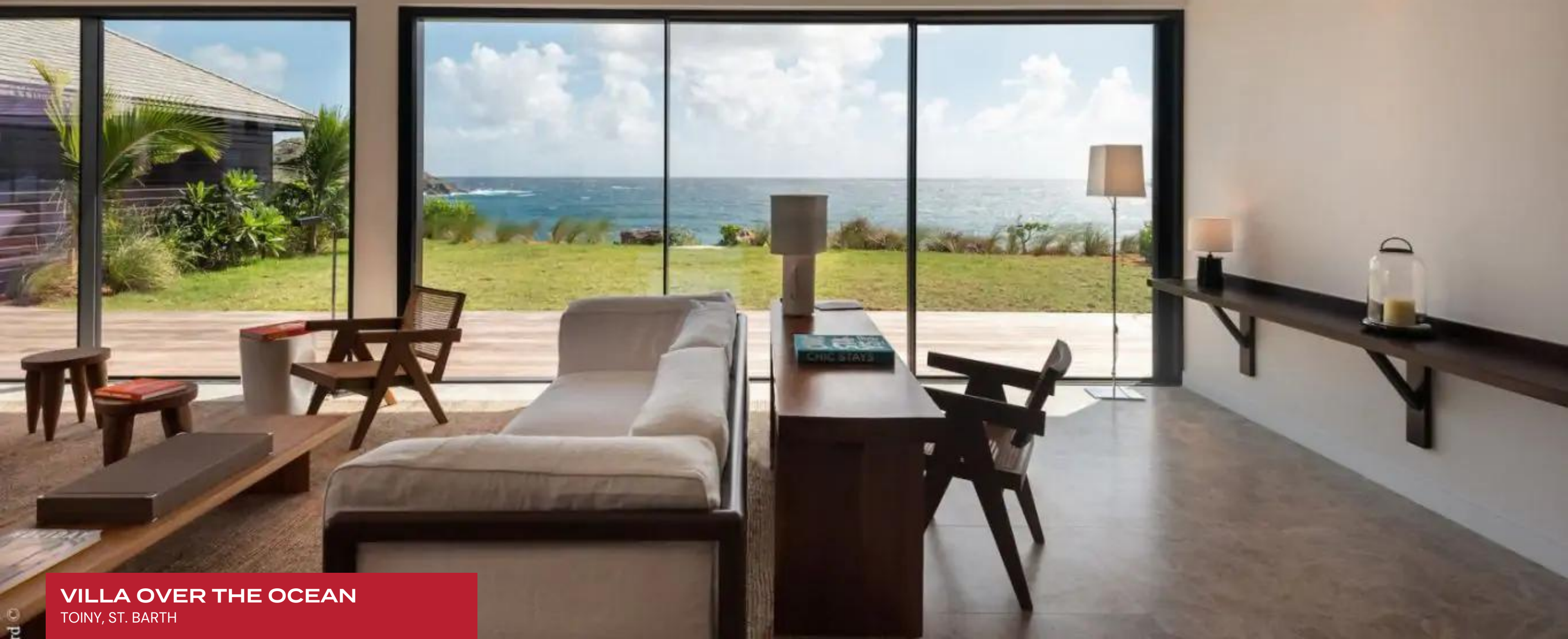
VILLA OVER THE OCEAN TOINY, ST. BARTH