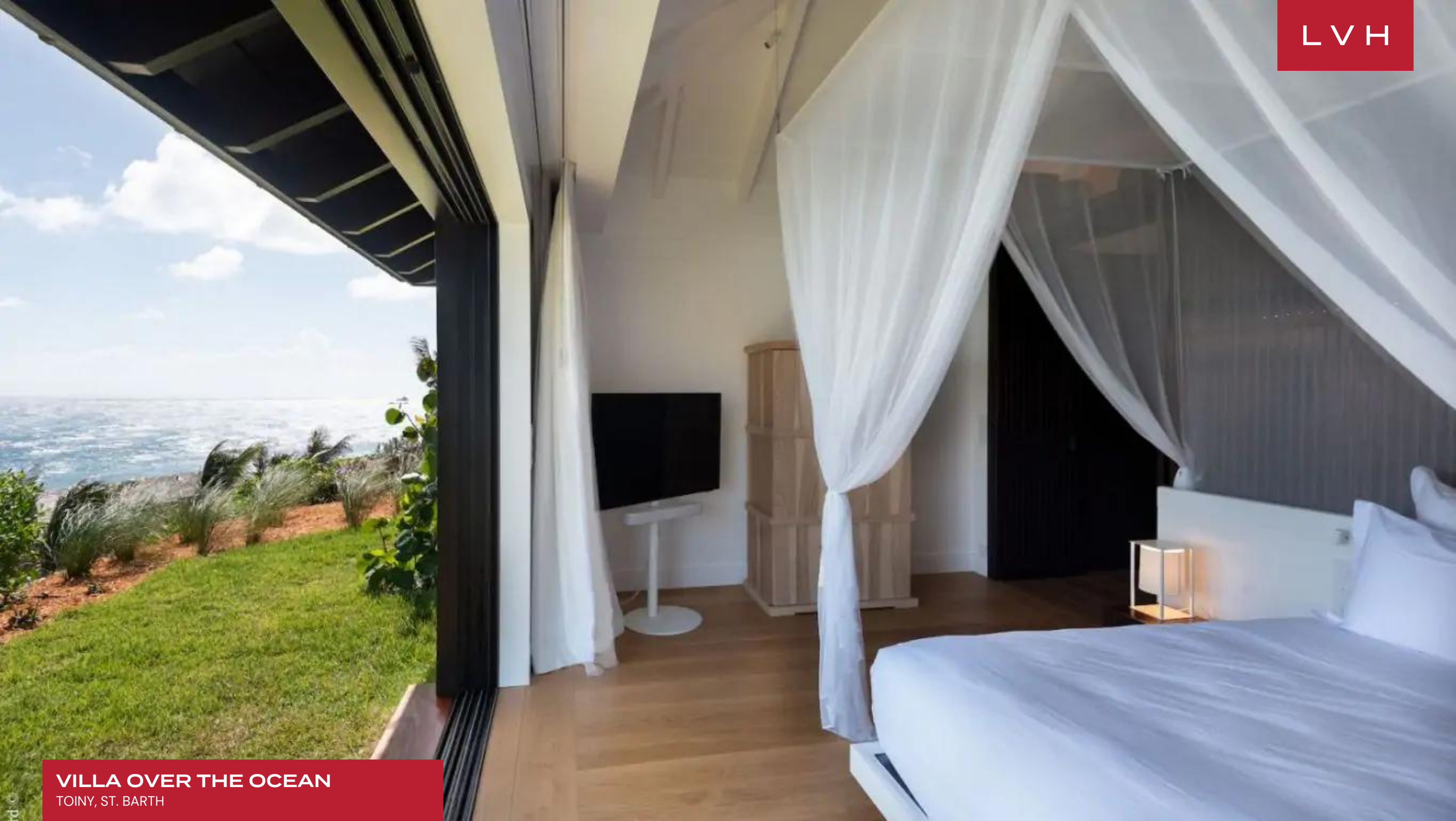
VILLA OVER THE OCEAN TOINY, ST. BARTH